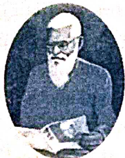
Swami Keshvanand (1883 - 1972)