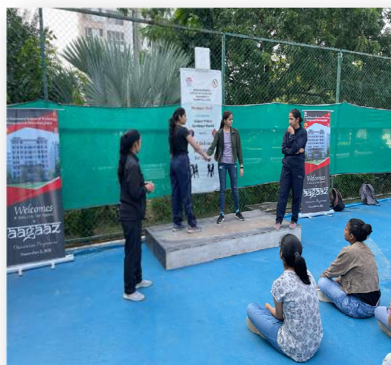
Glimpses of the Workshop