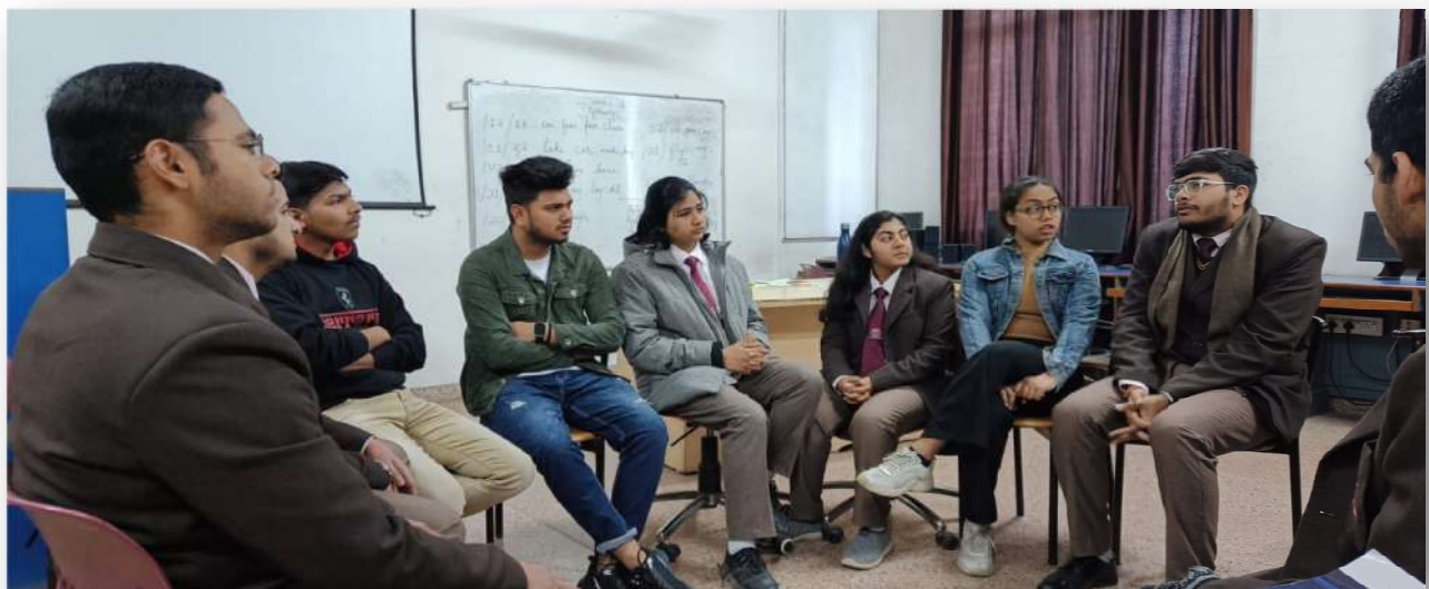
Group Discussion in Language Lab during Proficiency Enhancement Classes

Proficiency classes for English, Mathematics, and Computer were held during the induction program as per the schedule. These special classes catered to the academic domain of proficiency among budding engineers. These proficiency classes were aimed at giving a push to the basic requirements and challenges to students in the specified subjects. These classes were designed in the shape of introductory lectures pertaining to the subjects prescribed in the RTU syllabus of B. Tech.