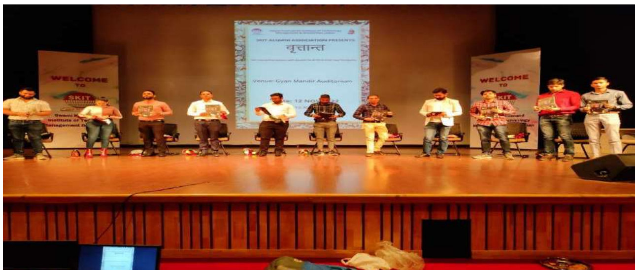
Some Glimpses of the Session